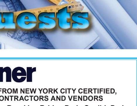
and finishing work. Please see the Turner notice below for more project and contact details. Brooklyn Bridge Park, one of New York City's favorites, extends along a mile of waterfront and piers. The view of Manhattan is extraordinary.

Turner Construction Company, an international construction services firm based in New York, has been awarded the contract to build the new Squibb Bridge designed by Arup, an international design and engineering firm based in London with an office in New York. The project is scheduled for completion in the summer of 2020. Turner is seeking construction management services from among firms owned by minorities or women. They are inviting cost proposals from New York City certified, Vindex approved M/WBE contractors and vendors. The due date for this part of the project is June 1, 2019. As described in Turner's request, posted below, the project will include a site survey, removal of the existing nine bridge spans in a safe, efficient, and nondisruptive manner, delivery and installation of new spans designed by Arup and fabricated off site,